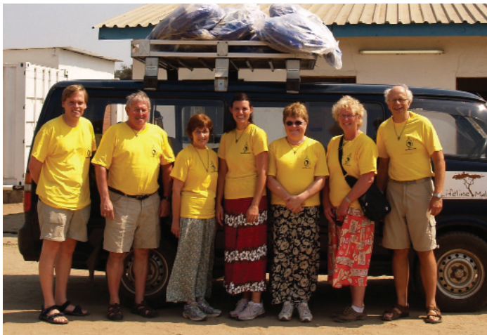
EMAS Lifeline Malawi Team

EMAS sponsors medical, surgical and dental missions teams, to work in specific locations overseas. New members are always welcome to join these teams. Those approved are sponsored by EMAS. They are expected to make arrangements for donations to cover the expenses incurred on their behalf. For more information, visit our website at: www.emascanada.org/MissionTrips