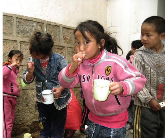
Teaching the children to brush in China South

The team also found ways to share their faith with patients. For example, they wrote on the blackboard of the treatment room in Chinese: "Love your neighbour as yourself" and conversations