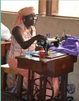
Ugandan woman sewing to generate an income.

We are working with an indigenous NGO which runs a small hospital in the foothills of the Rwenzori Mountains. They have recently built a maternity ward and in 2010 we cared for patients and worked to strengthen the staff's ability to deal with deliveries, while training Traditional Birth Attendants and Village Health Workers. The maternity ward is in much need of basic supplies, such as sheets, blankets, receiving blankets, etc.