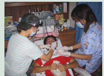
Dental team in Guangdong.

I n China's richest province, millions of people live below the poverty line. Healthcare benefits are not available to factory workers and villagers. The Guangdong team serves factory workers and villagers in the southern part of the province in an attempt to meet their needs, both physically and spiritually. The team also participates in the Family Practice Residents' Training Program at our Christian partner clinic in Macau.