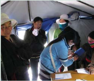
Yushu clinic in tent.