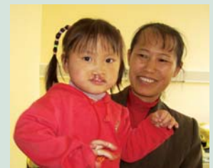
Girl with cleft lip.

T he China South team makes a difference in children's lives by operating on injuries, burns, cleft lips, cleft palates, congenital deformities etc. Corrective surgery can change someone's life. Funds are needed for hospital charges, equipment, medication, hospital food, the rehab program and the local prosthesis factory.