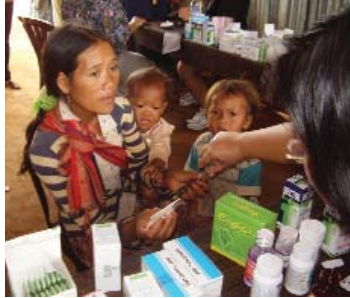
Treating patients in Vietnam

S erving in several provinces, the Vietnam team treats thousands of patients, setting up medical clinics, performing eye surgeries, dental care, dispensing medications, eye glasses, food and clothing.