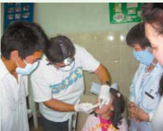
Teaching students in Mongolia.

EMAS sponsors Christian medical and dental students, who feel called to the mission field and meet EMAS’ approval criteria. You can contribute to their mission trip by donating to the Student Mission Fund . A great number of lives could be touched for God through a young missionary.