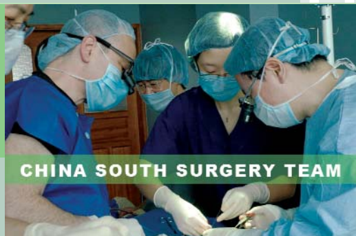
CHINA SOUTH SURGERY TEAM

EMAS sponsors medical/dental missions teams, to work in specific locations overseas. New members are welcome to join. The team composition is determined by the team leader. Those approved are sponsored by EMAS. They are expected to raise funds equal to the expenses incurred on their behalf. For more information, visit our website at: www.emascanada.org/missiontrips.htm