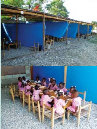
Temporary housing for the El-Shaddai School and Feeding Centre.

The destructive earthquake that hit the Port-au-Prince region on January 12, 2010 killed 200,000, injured 300,000 and left 1.5 million homeless. The assistance provided by EMAS CANADA was the only support the Bon Repos community received. Mass food distributions were organized by our Haitian partners.